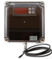
TRA-20A-STAT – 20Amp Trace Heating Thermostat