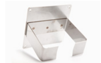
TRA-125-MBRK – Pipe Mounting Bracket for Thermostat and Junction Boxes