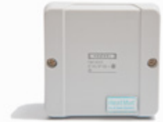
TRA-JUN-PREM – Premium IP67 4 Way Junction Box