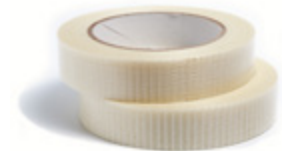
TRA-50M-GLFB – 50m Glass Fibre Fitting Tape